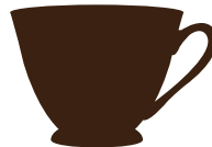
Dunked & Disorderly