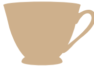
Splash & Grab